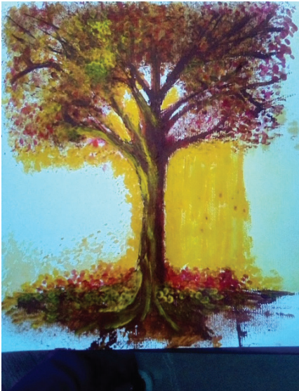
Art by Jibril Bey, The Welcome Church

“[Jesus] told them a parable: ‘Look at the fig tree and all the trees; as soon as they sprout leaves you can see for yourselves and know that summer is already near’” (Luke 21:29-30).