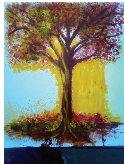
Art by Jibril Bey, The Welcome Church

“[Jesus] told them a parable: ‘Look at the fig tree and all the trees; as soon as they sprout leaves you can see for yourselves and know that summer is already near’” (Luke 21:29-30).